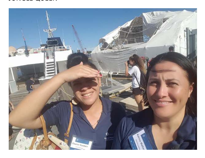
Attending Cook Islands CIYS yacht Sharkwater. Florida USA